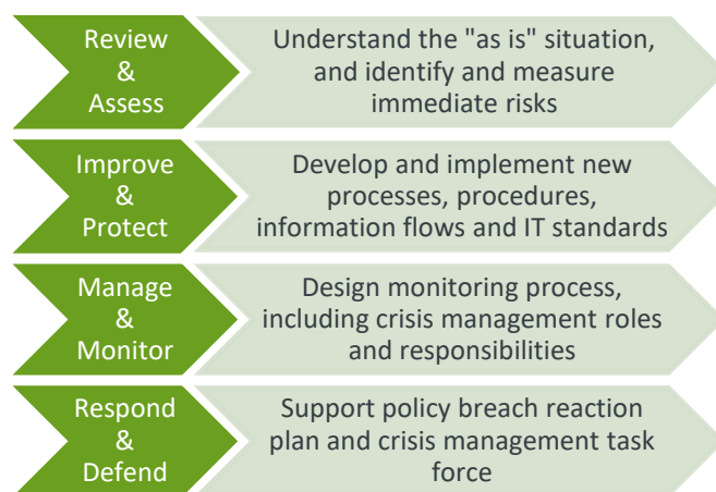
Your road map to trade secrets compliance

This proprietary framework and uniquely integrated approach mean we think differently about the complex challenges associated with trade secrets protection, and can provide a complete solution to help protect the future prosperity of your business.