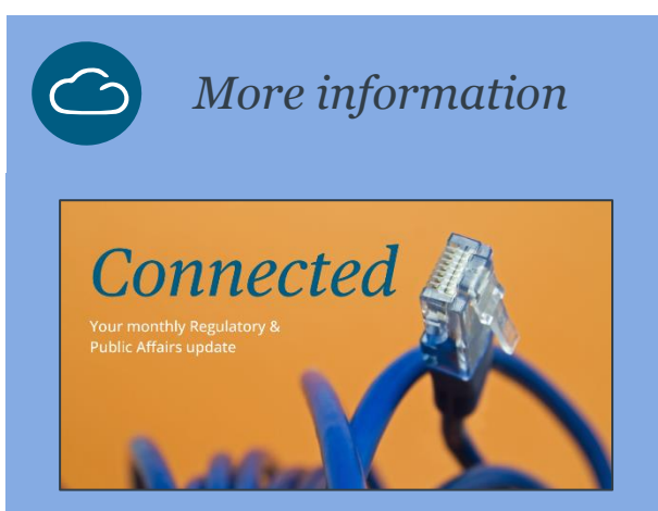
Sign up for our <u> Connected newsletter </u> for a monthly round-up from our Regulatory & Public Affairs team.